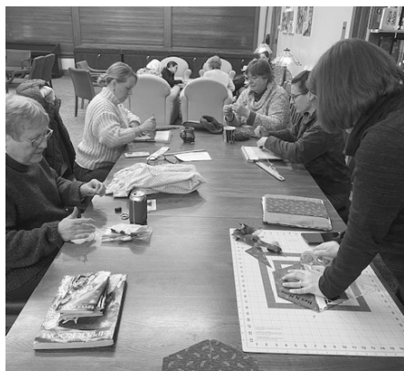
Above: Sunday Crafternoon Below: Puzzle Race winners, Team "Slow and Steady"